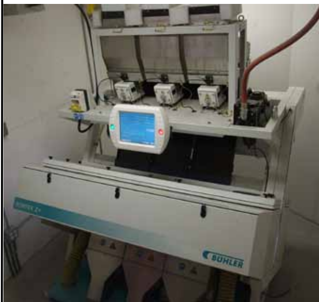
Above, the new seed sorter.

Costs of the project were shared by Lacombe County, which contributed $250,000 to the project, subject to a matching amount being raised through the sale of shares in the Co-Op.