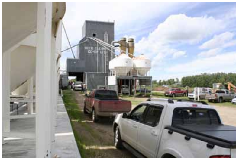
The Clive Seed Cleaning Co-Op

Co-Op members had put many hours of dedicated work into a massive upgrading of the facility, and the results seemed to please everyone in attendance for the celebration.