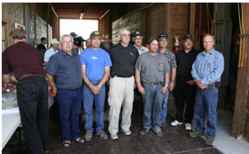
Above, Co-Op Board members gather for the camera.