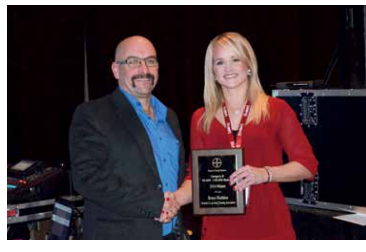
Category D: 15,000-30,000 bushels Barrhead Seed Plant